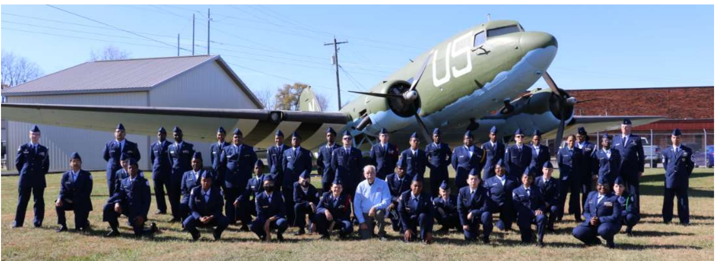
Junior Air Force ROTC cadets participated in a ceremony commemorating the Tuskegee Airmen Red Tails then visited Motts Military Museum

Develop grit and resilience: researchers have found that grit (perseverance and passion for long-term goals) is a better predictor for success over IQ or conscientiousness. Students should be well aware that they will face setbacks during the journey, and be prepared to bounce back when they do.