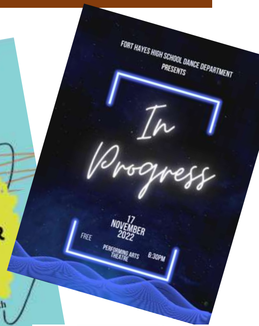
Fort Features Fall Edition